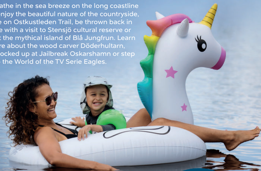
Everday Oskarshamn 2022

Breathe in the sea breeze on the long coastline or enjoy the beautiful nature of the countryside, hike on Ostkustleden Trail, be thrown back in time with a visit to Stensjö cultural reserve or visit the mythical island of Blå Jungfrun. Learn more about the wood carver Döderhultarn, be locked up at Jailbreak Oskarshamn or step into the World of the TV Serie Eagles.